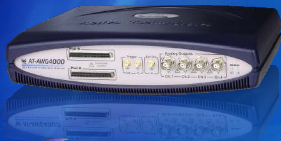
AT AT-AWG4000 1 GS/s Arbitrary Waveform Generator