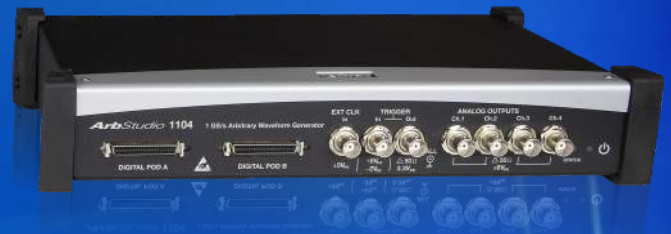
LeCroy ArbStudio 1 GS/s Arbitrary Waveform Generator