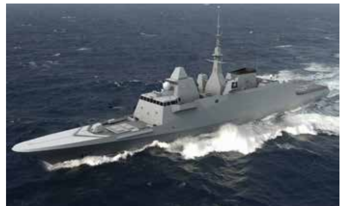
SONAR - Sonar image of shipwreck of the Latvian Naval Forces ship Virsaitis in Estonian waters.

There are several large experiments where Riders can be the perfect solution to combine high-speed transition time with high channels density (4 channel in just 3U – 19" rackmount).