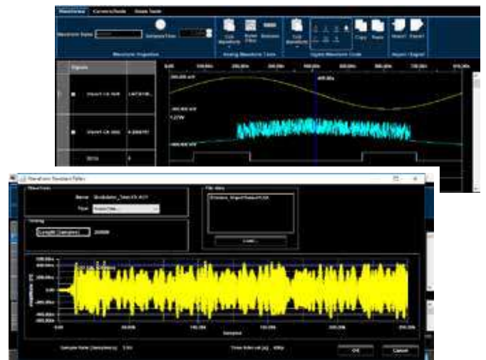
ExpertRider Import of I/Q Signals

Digital output combined with analog generation is an ideal tool to simplify digital designs and validation ( digital channels are optional ).