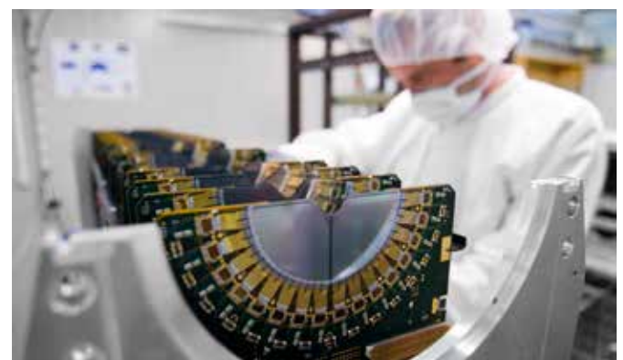
CERN - Assembling the last module of the vertex locator for LHCb.

The fast edges and pulse generation may be used to provide characterization in fast Power devices.